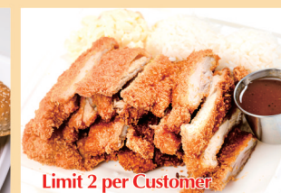
Limit 2 per Customer