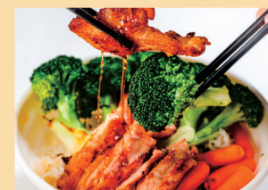
Healthy Bowl $9.99