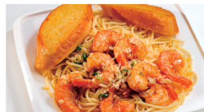
☺ Garlic Shrimp Spaghetti w/2 garlic bread $14.50