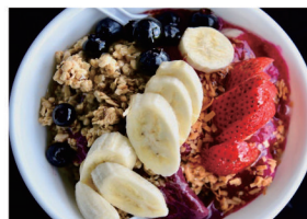
Acai Bowl $12.99