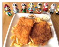
☺ Fish & Chips $11.99