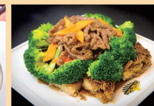
Beef Broccoli Cake Noodle $15.99