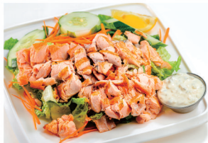
Grilled Fresh Salmon Salad $19.99