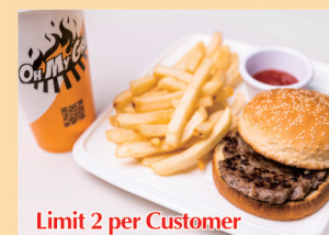
Limit 2 per Customer