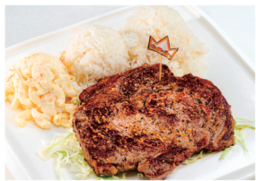
Rib Eye Steak $26.99