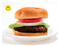
☺ Wagyu Burger $7.99