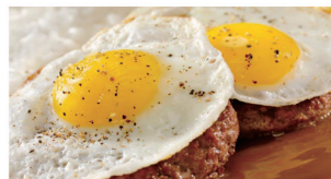
☺ Wagyu Loco Moco $17.99