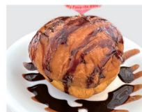
☺ Aloha Fried Ice Cream $5.99